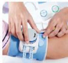
Digital Pressure Monitoring