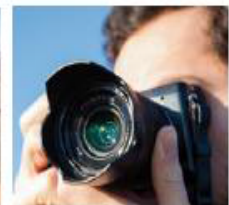
Digital Camera and more...