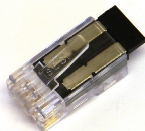
BEL STEWART PLUGS

For further information please contact the MBS Sales Team